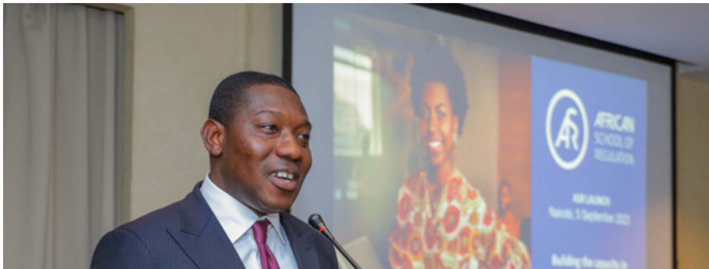
Hon. Herbert Krapa, Republic of Ghana's Deputy Minister of Energy, gives keynote remarks at ASR launch event